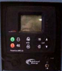
Digital display and controller.